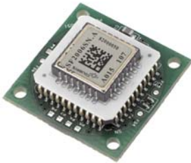
The SF2006 class B seismic sensor