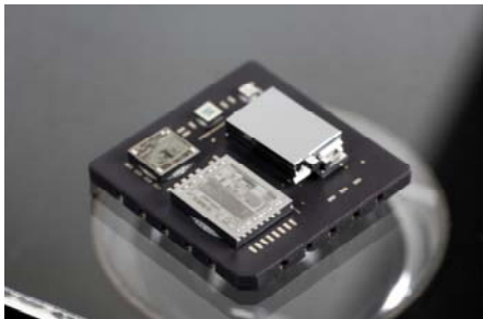
Close view of a Colibrys capacitive accelerometer.

Various technologies such as capacitive, piezoelectric or piezoresistive compete to provide the best solution. However these different sensing technologies do not offer the same level of performances and the best specifications in term of long term stability, temperature stability and precision are clearly offered by the capacitive products.