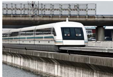
German Maglev train