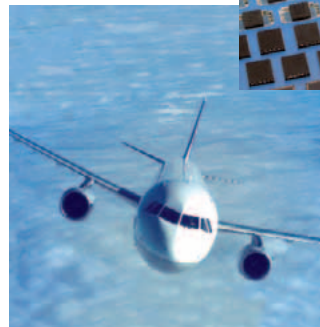
AHRS in civilian aircraft

MS8000.C products are available from the shelf for applications such as intelligent warriors, antenna or platform stabilization, range finding, submarine orientation and many others.