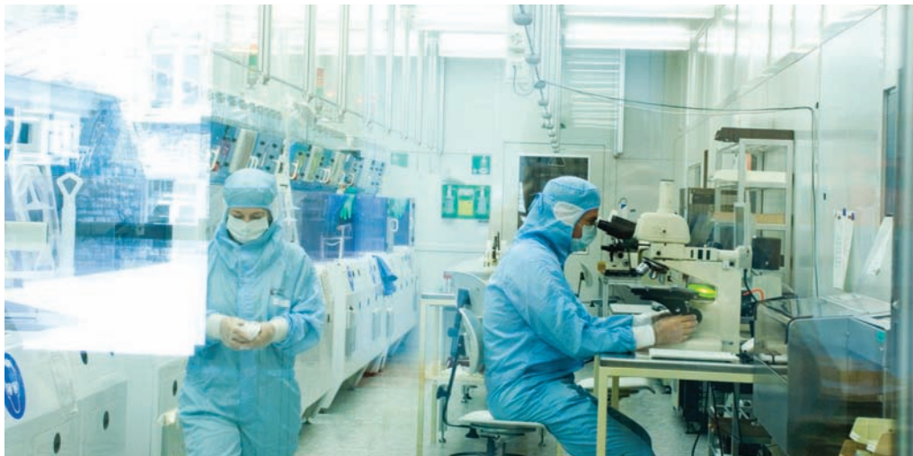
ABOVE: MEMS manufacturing using advanced equipments under clean room conditions